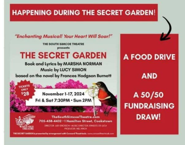
Tickets distributed at the Theatre.

Mary, a young recentlyorphaned girl is sent to England to live with her uncle.